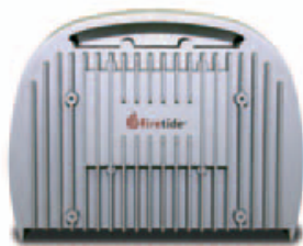
HotPort 6000 Outdoor Mesh Node

FireTide's end-to-end solution includes HotPort nodes for mesh infrastructure, HotPoint® access points for wireless access, HotView™ software for a complete management system, and HotView Controller™ for mesh and client mobility.