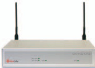
HotPort 6000 Indoor Mesh Node

Designed for seamless indoor and outdoor operation, the HotPort mesh network securely handles concurrent video, voice, and data applications, making it ideal for municipal, public safety, and industrial networks. The mesh's self-forming and self-healing properties enable rapid deployment and dependable operation. FireTide's AutoMesh™ routing protocol manages network load and traffic congestion to optimize mesh-wide performance and capacity.